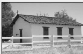
Paso Robles, CA; California Historical Landmark 542

The Estrella Adobe Church, the first Protestant church in northern San Luis Obispo County, was built in 1878-1885 by early pioneers.