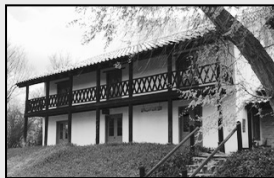
San Miguel, CA; California Historical Landmark 936

This former residence, inn, and stage stop was constructed in 1835 and is located on the old mission trail between San Francisco